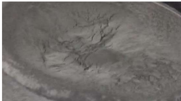
Fig. 1 Cement used