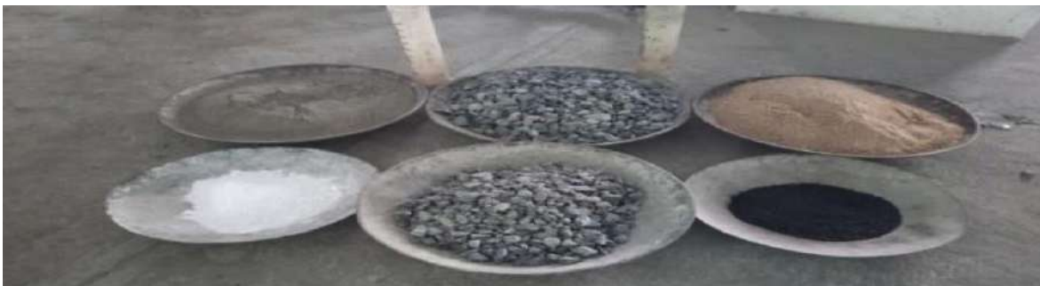
Fig. 5: Materials batching

Samples of various concrete aggregates were cast and tested to determine different strengths. A 150mm × 150 mm × 150mm cube was constructed to determine the compressive strength of the concrete. A prismatic beam of dimensions 100 mm × 100 mm × 500 mm was shot to test the impact force. A reinforced concrete block with dimensions of 100mm × 200mm × 1200mm was cast to study the load-deflection behavior of the beam, where only good quality mixes are cast and the optimal mix is obtained from dynamic tension and strength which creates test results.