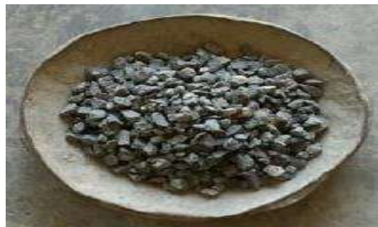
Fig. 3: Coarse Aggregate