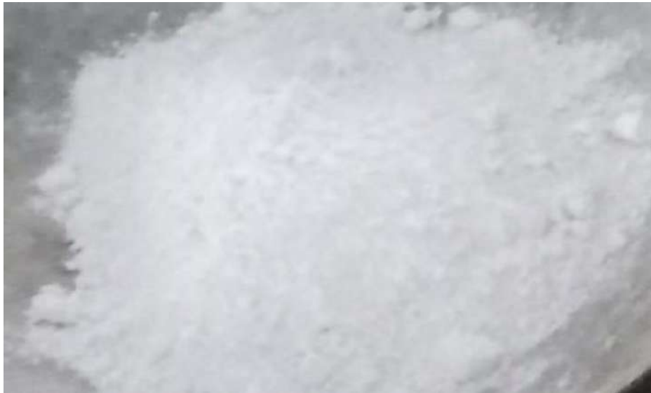
Fig. 4: Plastic waste

Silica fume, a highly pozzolanic component utilised to improve the mechanical and durability of concrete, which is a by-product of ferrosilicon manufacturing. Either add the components separately to the concrete or combine them with the Portland cement and silica fume. Producing silicon metal or ferrosilicon alloys results in the emission of silica fumes. Its extremely reactive pozzolanic quality makes it ideal for usage in HPC. Extremely strong and long-lasting concrete is possible using silica fume. Table 4 lists the characteristics of silica fume. The concrete was created using five layers of replacement material, specifically aggregate by volume percentages of 5%, 10%, and 15%.