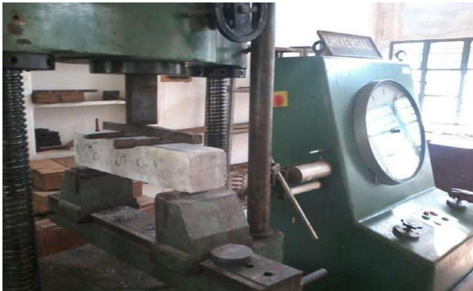
Fig. 7: Flexural strength test

The tensile strength of concrete is indirectly evaluated using the Flexural Strength Test. An unreinforced concrete slab or beam's resistance to impact failure can be tested in this way. Parameters of fracture indicating MPa are the results of flexural tests on concrete. The specimens utilised were beams measuring 100 mm × 100 mm × 500 mm. After 7 and 28 days of curing, the specimens were left to dry in the open air. Then, they were tested for flexural strength using a flexural testing apparatus.