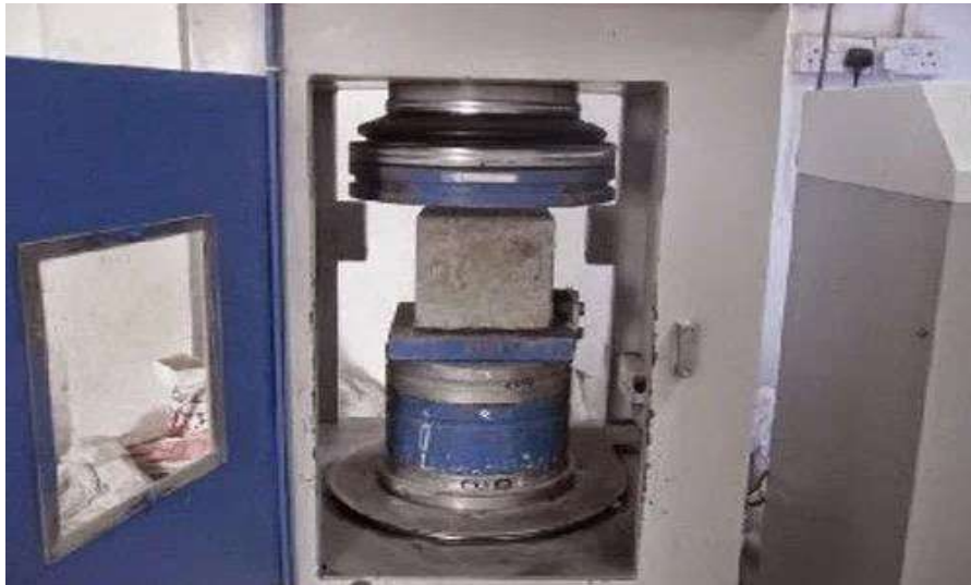
Fig. 6: Compressive strength test

Tests were conducted on the concrete mix using a Universal Testing Machine (UTM). Tests were conducted to analyze compressive strength and impact strength. For each test, a standardized test procedure is followed and the performance of the concrete mix is studied. The tensile strength of the concrete cube at 7 years and the tensile strength at 28 days were evaluated using a tensile test at 2000 kN. Once the test sample is ready, force is steadily applied to it until it fails. The maximum force required to cause the sample's failure is recorded, and this value is used to determine the sample's shear strength.