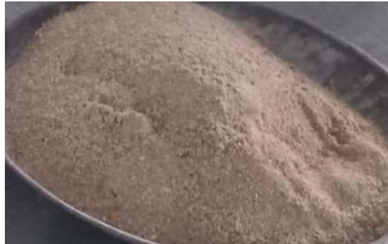
Fig. 2: Fine aggregate