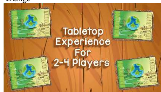
The game can be played by a minimum of 2 players and a maximum of 4 players.