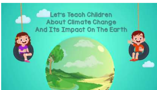
To aims to teach children about climate change and its impact on the earth.