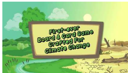
It's a combination of board and card game to introduced numerous issues of climate change