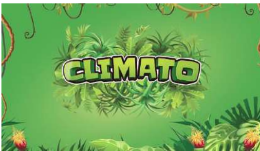
Climate change awareness game named CLIMATO was developed

The main objective of this research was to comprehend how game designers from various backgrounds approach the goal of creating an educational game in a collaborative process and how they explain elements of climate change science to a public audience. To help the public understand the complexity of climate change, we created the educational game CLIMATO. Here are the some of the glimpse of the game Climato.