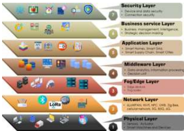
Fig 3. A Visualization of the Anatomy of 7-Layer IoT Architecture. [6]

The examination led by Liu et al. (2023) [7] researches the utilization of blockchain innovation in the field of production network and coordinated operations. They accentuate the potential for blockchain innovation to further develop production network tasks regarding straightforwardness, discernibility, and security. A coordinated BMSCS (blockchain-based marine store network framework) that is appropriate for the extension of the worldwide economy is proposed by the creators, who likewise make another activity the board style for the sea inventory network. At last, based on an examination of the consequences of the momentum research, sensible ideas for the future activity and improvement of the BMSCS are proposed. These ideas are expected to work on the coordination among individuals, accelerate the execution of blockchain innovation in the sea business, and bit by bit achieve the wise activity of the oceanic store network. Figure 4 shows the commonsense execution of the blockchain innovation that is presently being used in the nautical business. A critical commitment has been made by the record to the transportation of freight, the plan and working of boats, and the checking of the entire life pattern of boats, regardless of the way that it is a somewhat new innovation.