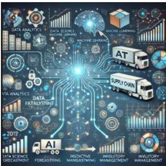
Fig. 1. AI in SCM. [3].

Involving man-made reasoning in the administration of supply chains is still in its early stages. Along these lines, there are relatively few limitations that control how it very well might be utilized. Along these lines, associations might be passed on uncertain about how to utilize man-made brainpower and how to consent to the principles that are applicable (Fig. 1) It is [3]. By and large, the utilization of man-made reasoning in production network the board brings about benefits, for example, expanded productivity, diminished costs, more prominent client assistance, and upgraded risk the executives. The utilization of computerized reasoning will keep on modifying production network activities and advance development in the area (Fig. 2) as innovation keeps on moving along.